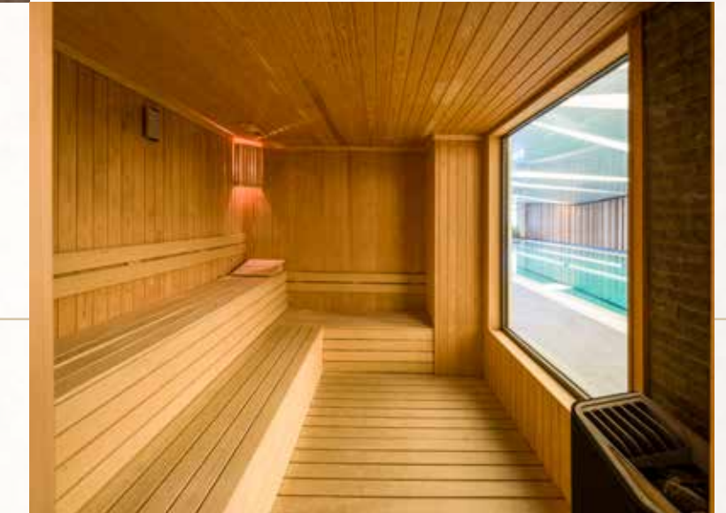
Sauna and Steam Room

In this unique living space, you can take long walks in nature if you wish, enrich your independent life in exclusive social centers only for residents, and achieve a holistic peace of mind and body with unique experiences such as fitness, SPA, and sauna.