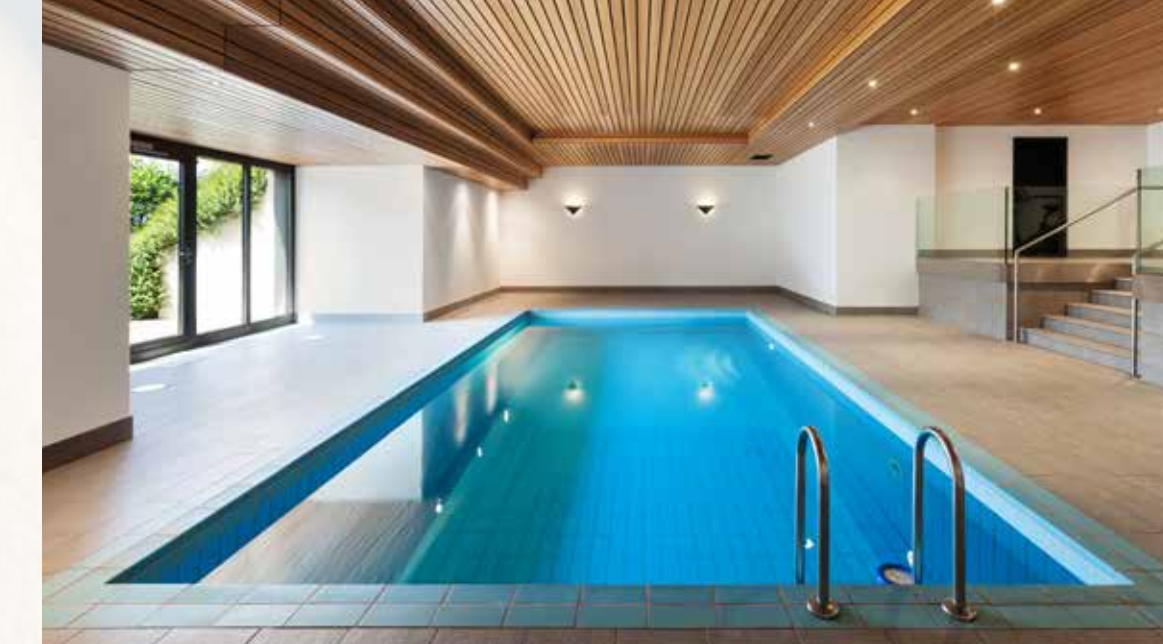
Indoor Swimming Pool